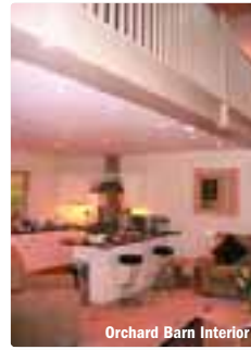
Orchard Barn Interior