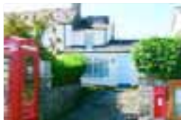
Also available - Wagtails - a super chalet apartment sleeping 2+1.

Middle Cottage is in a charming position on the village green overlooking the beach. It has quality furniture, and we provide fresh bed linen and towels plus logs for the cosy multi-fuel stove burner. It sleeps 5 in 2 bedrooms in comfort, and has a lounge, dining room, downstairs bathroom and rear sun patio with BBQ.